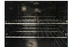
Self & Steam Clean